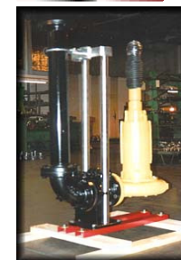
Water or Sewage: Horizontal & Vertical Cantilever