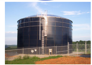
Liquid storage tank construction for municipal and industrial potable water and wastewater.