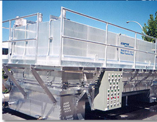
Packaged Treatment Plants to 10 MGD