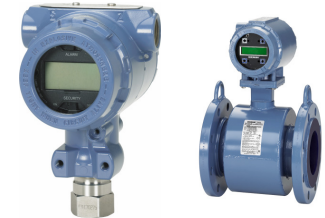
Your best source for pressure, temperature, flow and level measurement instrumentation