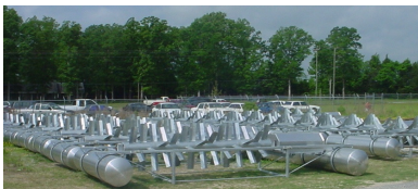
Floating Lagoon Aerators