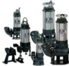
Submersible, Solids-handling, Pumps and Systems