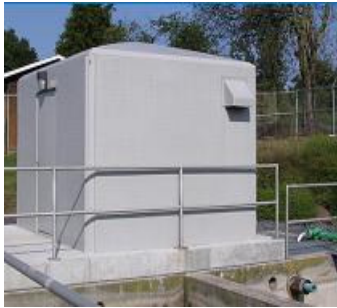
Engineered Fiberglass Enclosures