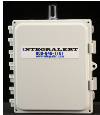
Web-To-Wireless Monitoring System